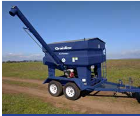
4.0 TONNE (50 BAG) FEED OUT TRAILER including 4m x 6 inch Auger