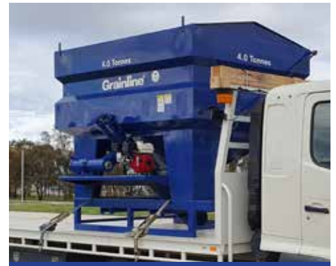
2.5 TONNE + 4.0 TONNE SKIDS