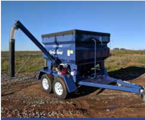
2.5 TONNE (30 BAG) FEED OUT TRAILER including 3m x 5 inch Auger